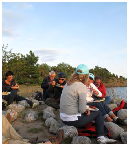
Picnic in the late but sunny evening...

Later in the evening, after a very well deserved shower, we all met again for a short trip with our Rivas to a very beautiful nearby island, named "Knappelskär".