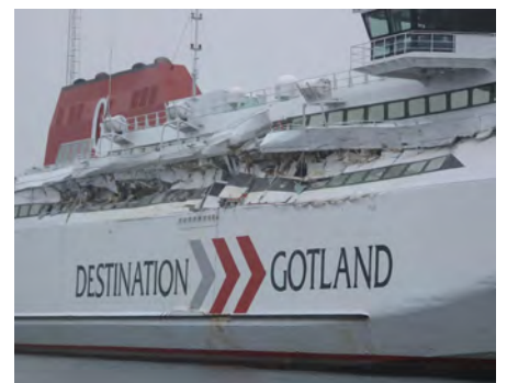
Ferry after collision.