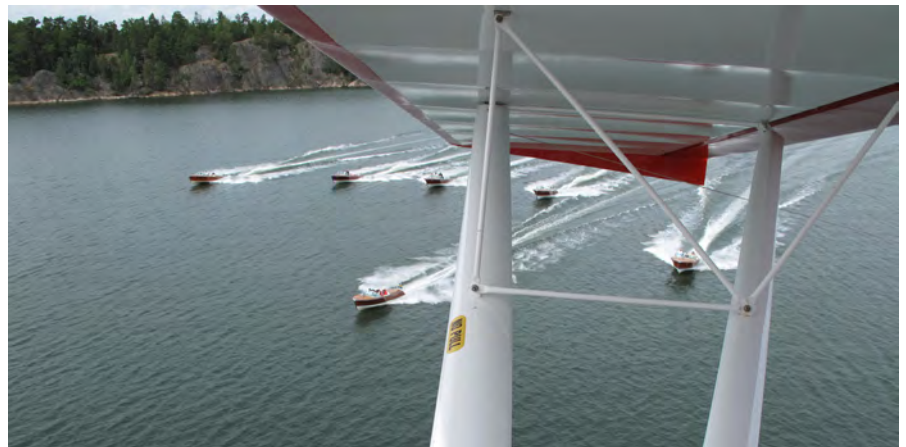
Low flying view of our Rivas!

This surprise was all set up by our club member Cathrine, who jumped into the sea plane and became the photographer of the day! In a typical Swedish and German manor, we also succeeded to organize an almost perfect formation run with our Rivas!