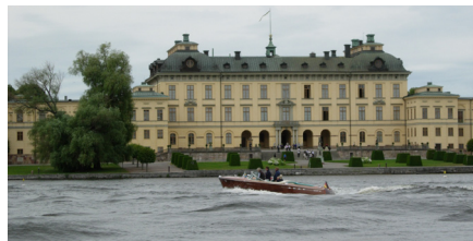
Passing Drottningholm Royal castle