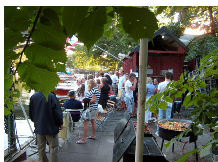
BBQ in the sunny Swedish summer evening

the way we had to pass one lock to enter the big lake Mälaren in order to reach the harbor at the former prison island Långholmen. The prison was in use until 1975 when it was reformed to a hotel and hostel. The prison cells are still kept as hotel rooms but you keep your own key to the door nowadays!