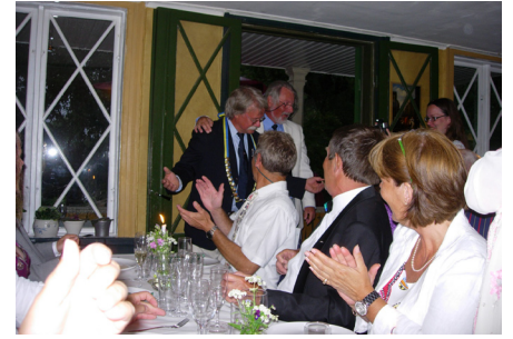
Gala dinner at Stora Henriksvik

This last day ended with our Gala Dinner and traditional prize giving ceremony. Because of the heavy rain we all appreciated that the restaurant, a former museum, was only 50 meters away from our hotel!