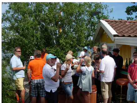
At the bar.