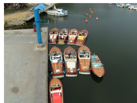
Bosö boat club harbour.

Previous years we have spent a lot of time in the outer regions, so this time we headed for the inner parts just outside of Stockholm.