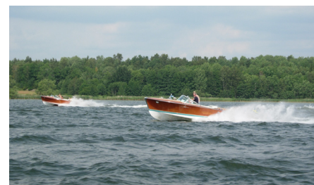
Full speed ahead is always nice!

After a winding trip around a lot of islands with pretty houses we ended up at Bosö boat club at the island Lidingö for a picnic lunch. After some minor boat repairs we went on for something that looks like a big lake but is accessible thru a very shallow and narrow canal. A perfect place for swimming and social floating Riva Rafts!