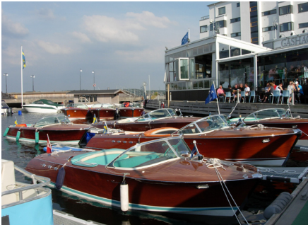
Dinner by the sea at Lidingö.

On the way back in the late afternoon we stopped for dinner at a dockside restaurant on the island Lidingö. We arrived back in Stockholm at about 11 pm, just in time for the last passing of the lock back to lake Mälaren. Total trip this day was more than 45 Nm.