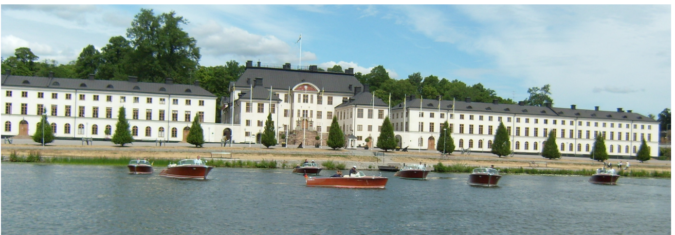
In front of Karlberg castle.