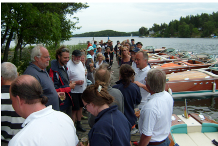
A welcome toast at Idskär.

Without their hospitality to let us use their bridges this meeting would not have been possible at all! To show our gratitude we had invited them to a lunch party at their own club island Idskär in Mälaren.