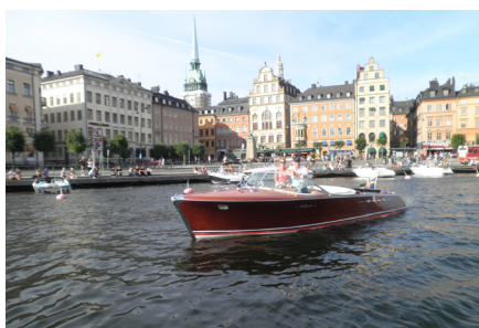
After passing the lock to Mälaren.

After a very tasty lunch we left in the afternoon for a trip to our base camp right in the middle of Stockholm. On