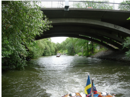
One of the canals in Stockholm.

The day ended with dinner at a very nice outdoor restaurant in Stockholm a few hundred meters from our prison island.